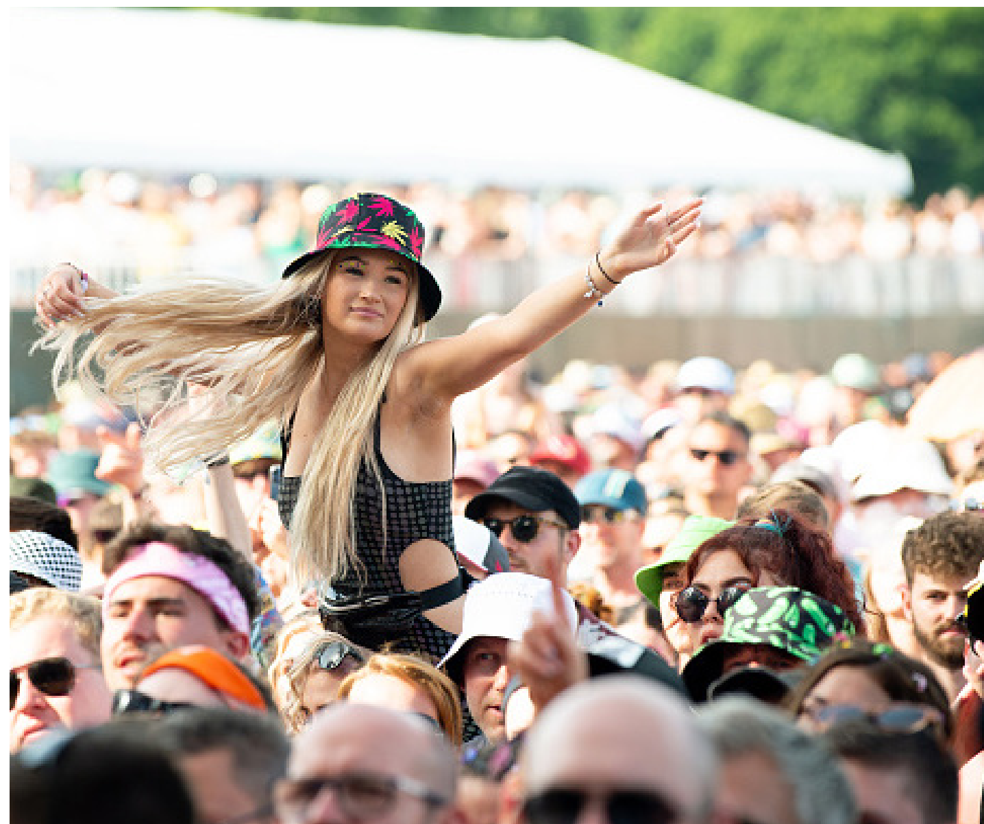
JUNE 17: Festival goes at The Isle of Wight Festival 2022 at Seaclose Park on June 17, 2022 in Newport, Isle of Wight.

The foiled plot comes amidst an upward trend in youth arrests in the UK. Senior counter terrorism officers recently revealed that more under 18s were arrested for terrorist-related activity between March 2021 and 2022