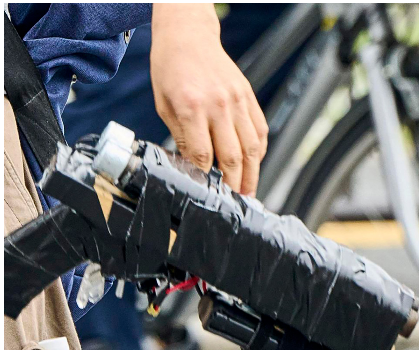
Shinzo Abe, the former prime minister of Japan, was assassinated on Friday by an assailant with an improvised firearm.

The assassination of the former Japanese Prime Minister illustrates how firearms can be constructed and used to carry out attacks, even in countries, like the UK, where gun control legislation makes it very difficult to acquire firearms. Experts estimate that