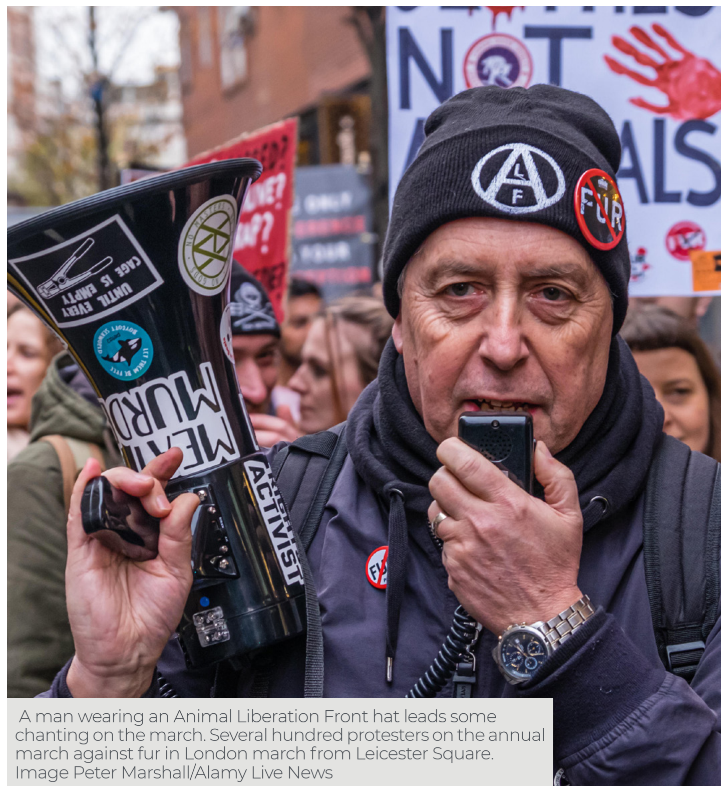
A man wearing an Animal Liberation Front hat leads some chanting on the march. Several hundred protesters on the annual march against fur in London march from Leicester Square.

The vast majority of eco-terrorism attacks involve the use of incendiary or explosive devices, and property damage – rather