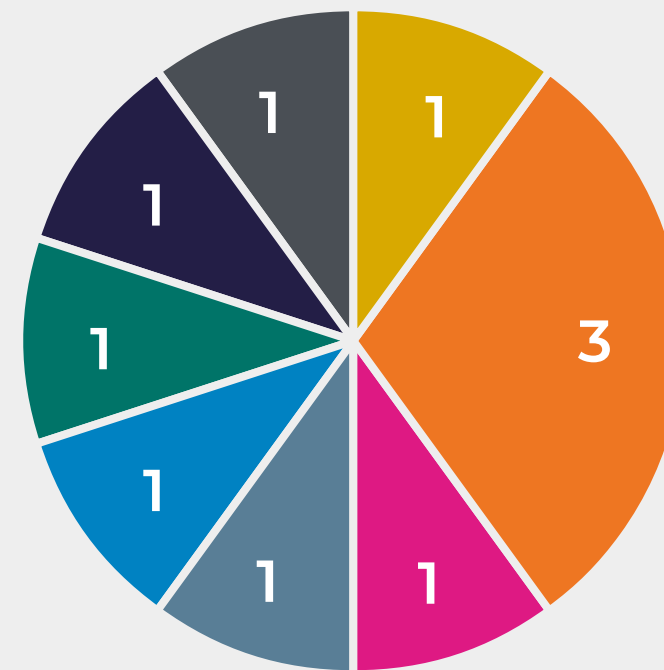
No. people charged, convicted or sentenced for terrorism offences in June 2022

One year on from MI5 Director General Ken McCallum’s warning about the increasing threat posed by far right extremism, all but one of the individuals charged, convicted or sentenced in June were linked to right wing ideologies. This is not to say that the threat from Islamist extremism has disappeared, but is instead a clear indicator that far right activity truly is a cause for concern. Of the 32 plots foiled by British security services since March 2017, 12 were related to right wing extremism. Given the increasing number of far right arrests over the past year, it is likely that we will see further far right plots being uncovered in the medium term, balancing the ideological motivations of plots in the UK.