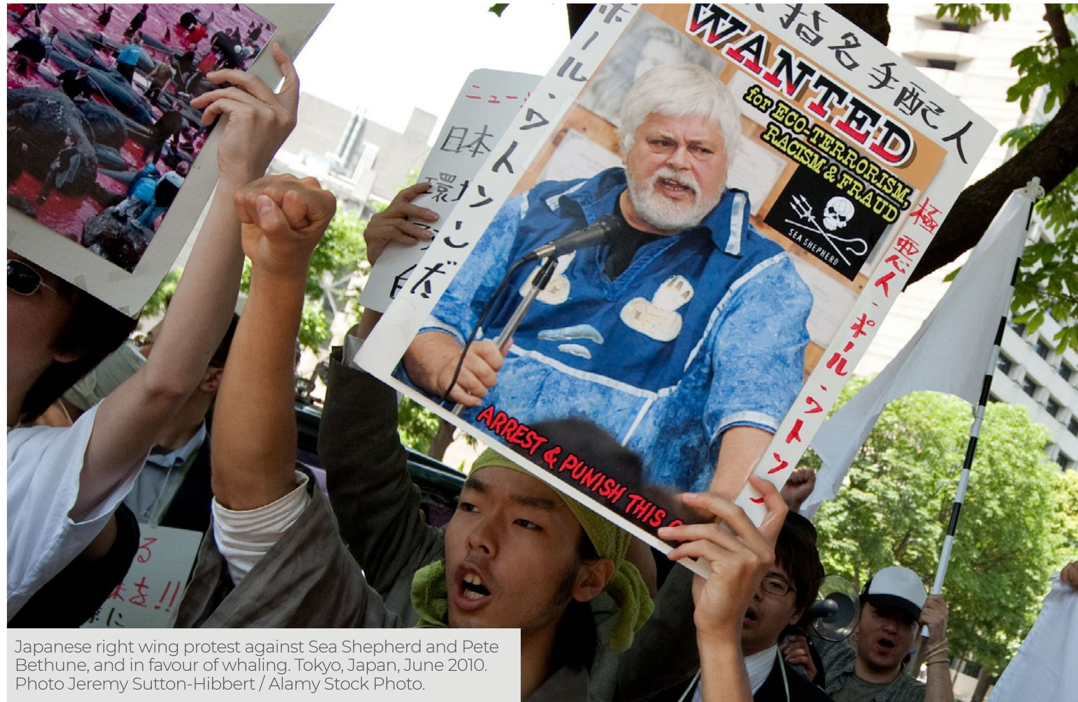
Japanese right wing protest against Sea Shepherd and Pete Bethune, and in favour of whaling. Tokyo, Japan, June 2010.

The threat posed by environmentally-motivated