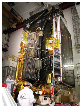
The Inmarsat 4 spacecraft with the integrated AM-1 reflector and boom